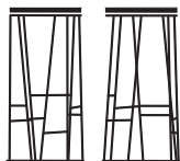
Level I and GREENGUARD Certified