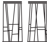
Level I and GREENGUARD Certified