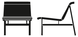
Level I and GREENGUARD Certified