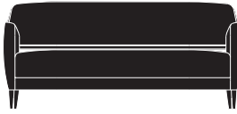
Level I and GREENGUARD Certified