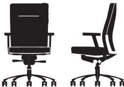
Level I and GREENGUARD Certified