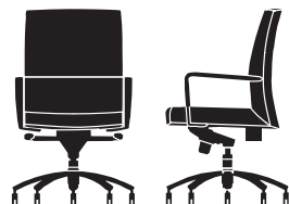
Level I and GREENGUARD Certified