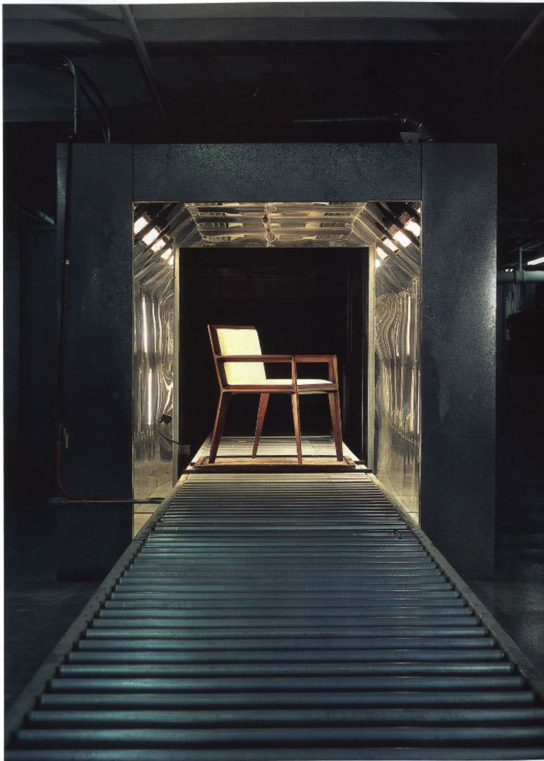
Clockwise from top left: CuldeSac's Whisper chair has leather upholstery. The frame is subtly textured maple. Ready to ship, the chairs will be delivered to showrooms nationwide.