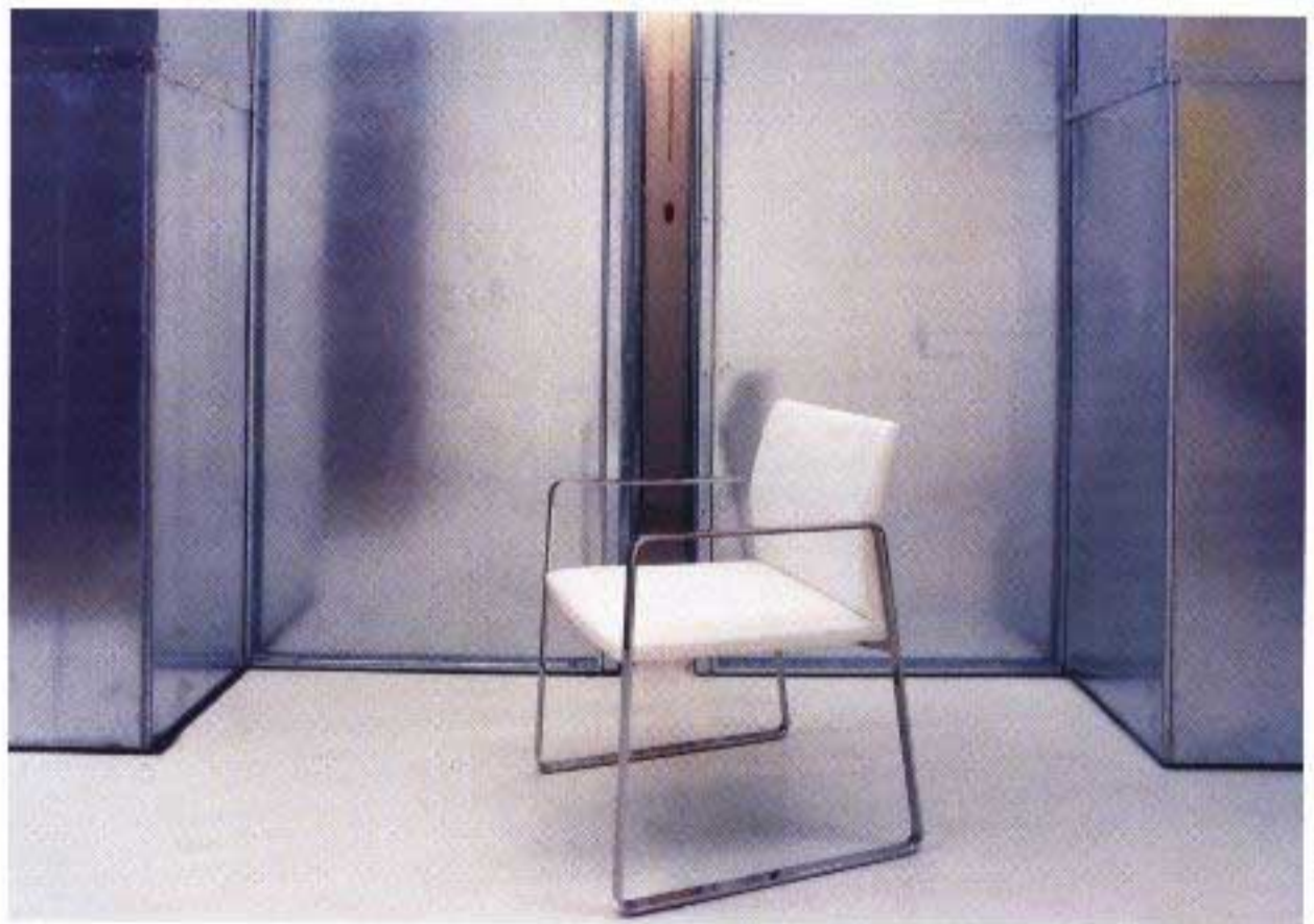
SAWN IN THE USA Top, patterns for chair frames at the Bernhardt Design factory Above, 'Celon' chair by Lievore Altherr Molina, from Global Edition collection

Similarly simple in a complex way is the 'Aro' barstool by the Barcelona-based collective Lievore Altherr Molina. Essentially three loops held together with two legs, the piece may look perfectly weightless but it is incredibly stable as a seat. Its fixed base and revolving seat make it suitable for residential as well as demanding commercial spaces. 'The barstool was the one piece I thought would be hard. I thought the perfect barstool had already»