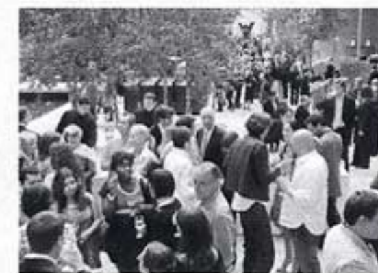
ULTRA COOL From top: Last year's ICFF opening party at MoMA; Due Studio's sleek sofa.

For one Saturday night each spring, Soho's Greene Street design shops are packed with what, at first glance, appear to be quintessential customers. They wear wonky Alain Mikli eyewear and shapeless Comme des Garçons frocks, but they're not seeking a living room suite. Rather, they're drinking prosecco and hobnobbing, the antidote to a long day in Javits at the International Contemporary Furniture Fair, the premier American modern design and furnishings trade show. By dusk, this design mafia descends on parties at Moss and Design Within Reach, but the impetus for the fête are the hyper-innovative products shown by the 600 exhibitors from around the globe. It's the kind of white-hot furniture that fills glossy magazines and boutique hotels—and Greene Street shops, of course. ICFF has American brands, too, such as Bernhardt Design, an offshoot of the North Carolina company that makes traditional furniture. This year it's showing a sofa by Due Studio so streamlined you'd hardly recognize it as American. It's not of course—the young designers hail from El Salvador and are so cutting edge they don't even wear spectacles yet. ICFF at the Jacob Javits Center is open to the public on May 19; Tickets $50; icff.com —Sophie Donelson