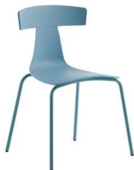
REMO plastic 1417-20-30-30 avion blue list $495 ☼