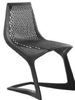
MYTO 1207-20-01 black list $582 ☼