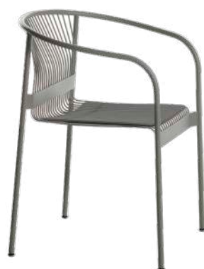
VELIT 1800-40-99-37 Concrete Grey list $1,030 ☼