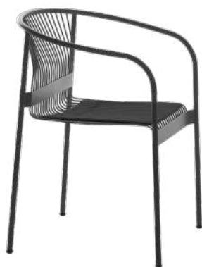
VELIT 1800-40-99-01 Black list $1,030 ☼