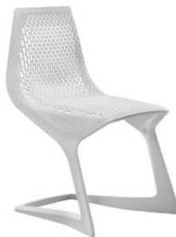
MYTO 1207-20-02 white list $582 ☼