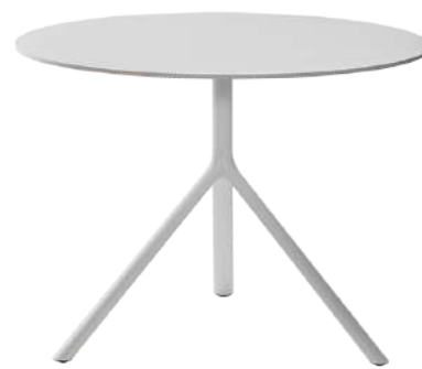
MIURA 9555-01-02-FM02 39 3/8" d white/white hpl list $2,356 ☼