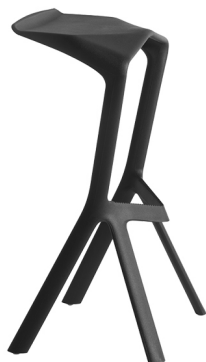
MIURA 8200-00-01 black list $525 ☼