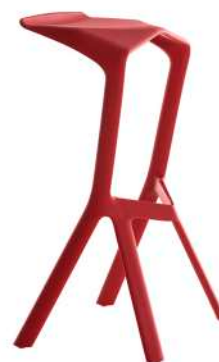
MIURA 8200-00-03 traffic red list $525 ☼