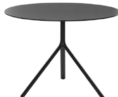
MIURA 9556-01-01-FM01 43 1/4" d black/black hpl list $2,356 ☼