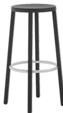
BLOCCO 8500-00-AB-ALS ash black list $1,009