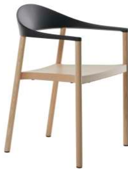
MONZA 1209-40-01-AN ash natural/black list $1,031