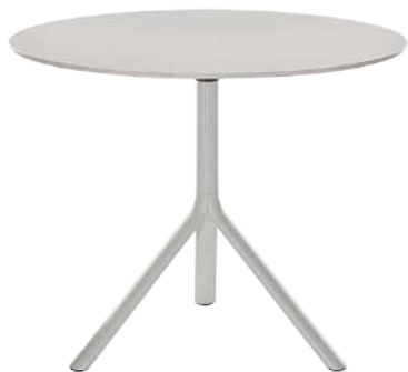
MIURA foldable 9592-01-FD-02-FM02 35 3/8" d white/white hpl list $1,907 ☼