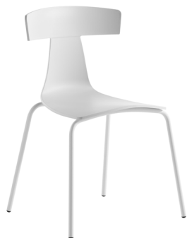
REMO plastic 1417-20-02-02 white list $495 ☼