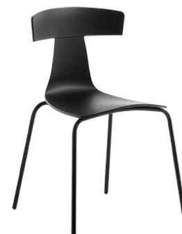
REMO plastic 1417-20-01-01 black list $495 ☼