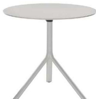
MIURA foldable 9591-01-FD-02-FM02 31 1/2" d white/white hpl list $1,513