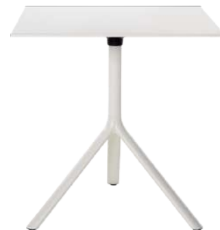
MIURA foldable 9580-01-FD-02-FM02 27 1/2" d x 27 1/2" w white/white hpl list $1,458