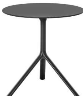
MIURA foldable 9590-01-FD-01-FM01 27 1/2" d black/black hpl list $1,316