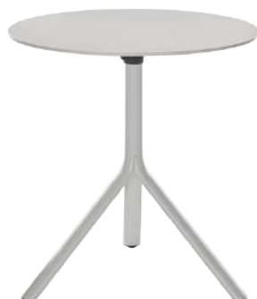
MIURA foldable 9590-01-FD-02-FM02 27 1/2" d white/white hpl list $1,458