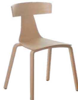
REMO wood 1415-20-AN ash natural list $1,042