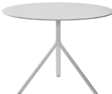
MIURA 9556-01-02-FM02 43 1/4" d white/white hpl list $2,619 ☼