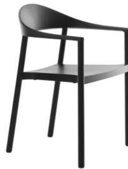
MONZA 1209-40-01-AB ash black/black list $1,031