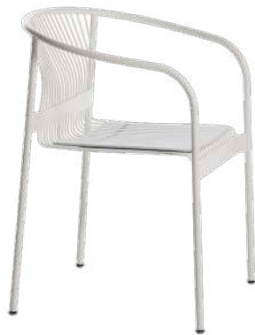
VELIT 1800-40-99-02 White list $1,030 ☼