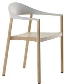
MONZA 1209-40-02-AN ash natural/white list $1,031