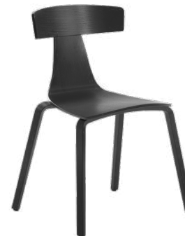
REMO wood 1415-20-AB ash black list $1,042