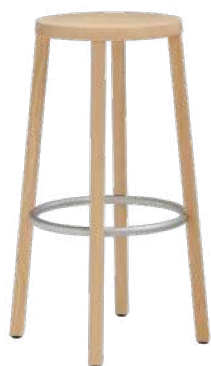
BLOCCO 8500-00-AN-ALS ash natural list $1,009