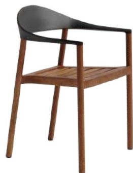
MONZA 1209-40-01-IR iroko/black list $1,349 ☼