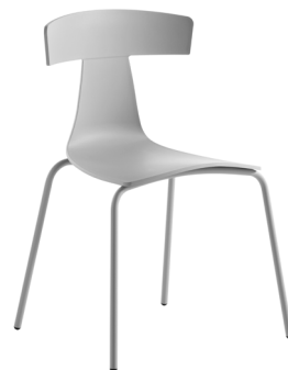
REMO plastic 1417-20-20-20 signal grey list $495 ☼