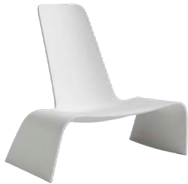
LAND 1100-00-02 white list $1,414 ☼