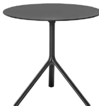
MIURA foldable 9591-01-FD-01-FM01 31 1/2" d black/black hpl list $1,349