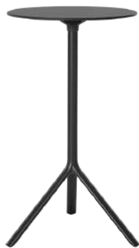
MIURA foldable 9553-71-FD-01-FM01 23 5/8" d black/black hpl list $1,261 ☼