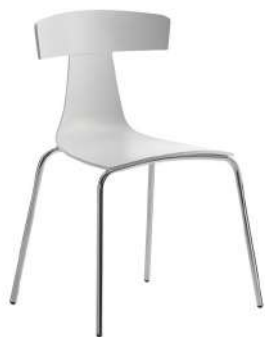
REMO plastic 1417-20-02-CH white/chrome list $495