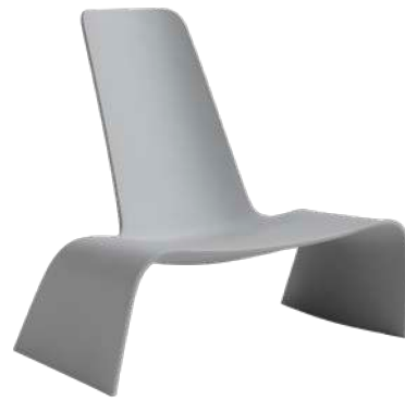
LAND 1100-00-20 signal grey list $1,414 ☼