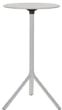
MIURA foldable 9553-71-FD-02-FM02 23 5/8" d white/white hpl list $1,360 ☼