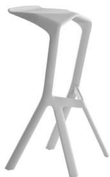
MIURA 8200-00-02 white list $525 ☼