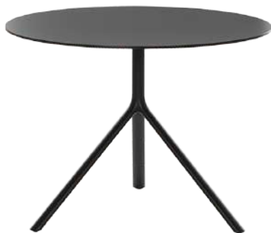
MIURA 9555-01-01-FM01 39 3/8" d black/black hpl list $2,137 ☼