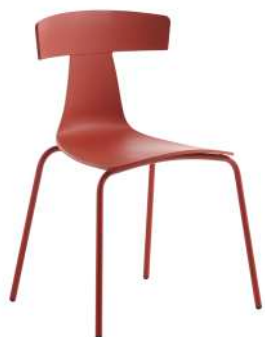
REMO plastic 1417-20-31-31 coral red list $495 ☼