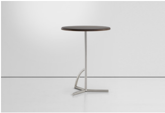
Stainless steel base.